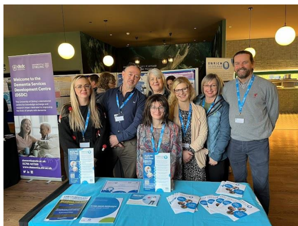
1 - The Team...